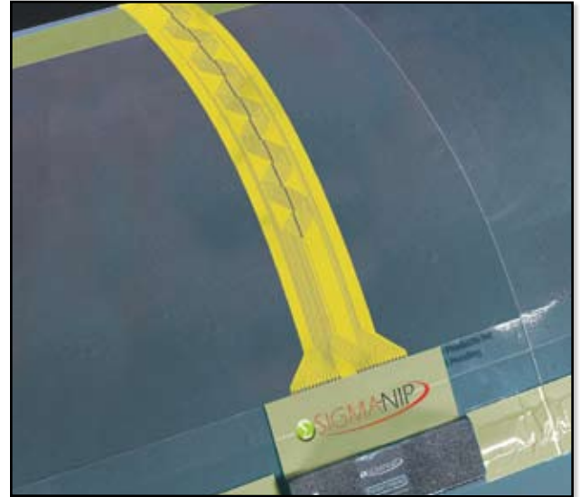
Close up view of single sensor element

Through the application of sophisticated mathematical algorithms, Sigma-Nip® is able to discern the pressure distribution between nip rolls with a high degree of accuracy never before attainable. Each sensor is individually calibrated, serialized and carefully assembled to exacting tolerances. The sensor is designed to withstand repeated high pressures, conform to radiused surfaces and routine exposure to grease, liquids and inks.